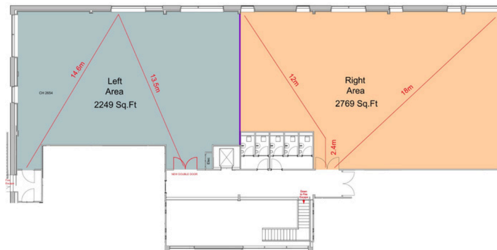
1 Vacant Area Plan - Floor 1, Vision Court 1:100